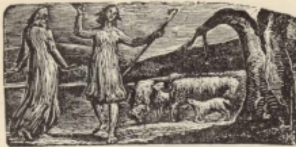
THE MODERN SCHOOL