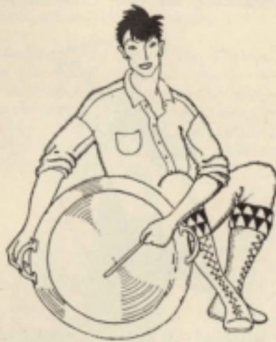
THE DRUMMER FOR THE CARIBOU DANCE

Caribou have not come. Now we will call them by the magic power of this dance. See, they come, the Caribou!" At this he beats a single step on the drum and the four Caribou, who have been standing off to one side away from the camp-fire, [this is a bundle of sticks if indoors] come solemnly marching in. They lift their