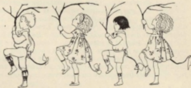
THE CARIBOU DANCE

is an American Indian folk dance introduced by Ernest T. Seton and was intended by the Red Men to be a sacred ritual by which to attract to their hunting grounds one of those wandering herds of caribou on which the northern tribes so largely depended for food. Certain simple properties are needed for the dance--four caribou horns and four tails. Have ready before the dance begins four branches roughly cut in the shape of horns (see illustration) and four sections of barrel hoop or any curved piece of wood, for tails. Tie a handkerchief on the end of each hoop. This represents the white tuft on the end of caribou's tail. During the dance the horns and tails are held as in the illustration below.